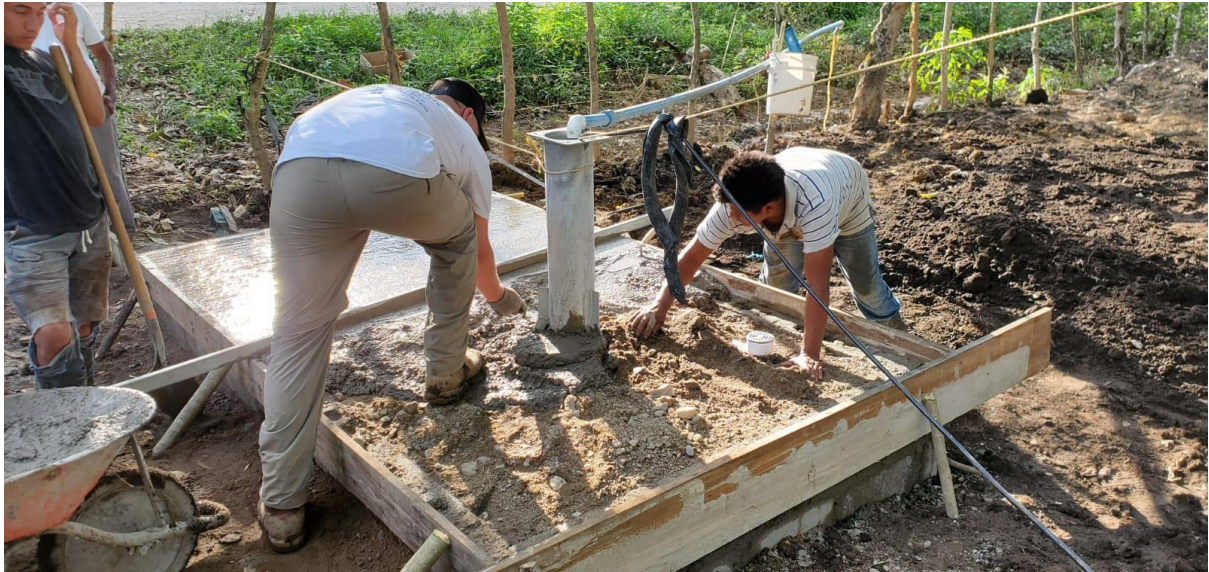
Community men in action while preparing the cement pad for the water pump installation and getting ready for the well dedication ceremony the next day.